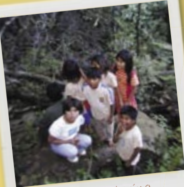
Guaraní children playing at the foot of a waterfall