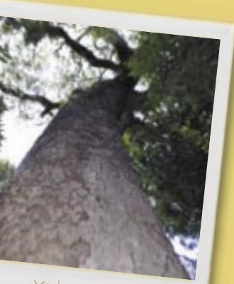
Yerbamaté tree (Ilex paraguariensis)

The strongest message we received from the Guaraní people was concern for the forests that are their livelihood