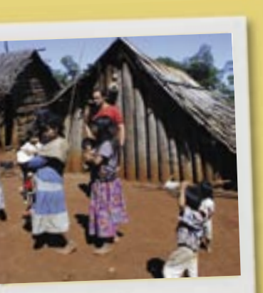
víllage lífe Guaraní style

and power come from the forests. Tom Lovejoy, an ornithologist who was creator of the large programme on the dynamics of forest fragments in the Amazon rainforest near to Manaus, Brazil, spoke on how the restoration of the watershed that provides water for New York City in the Adirondack Mountains turned out to be a much cheaper way of providing clean water than the elaborate purification plant that was originally planned.