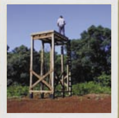
Surveying the forests of Yaboti